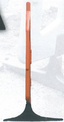
Anti trip foot