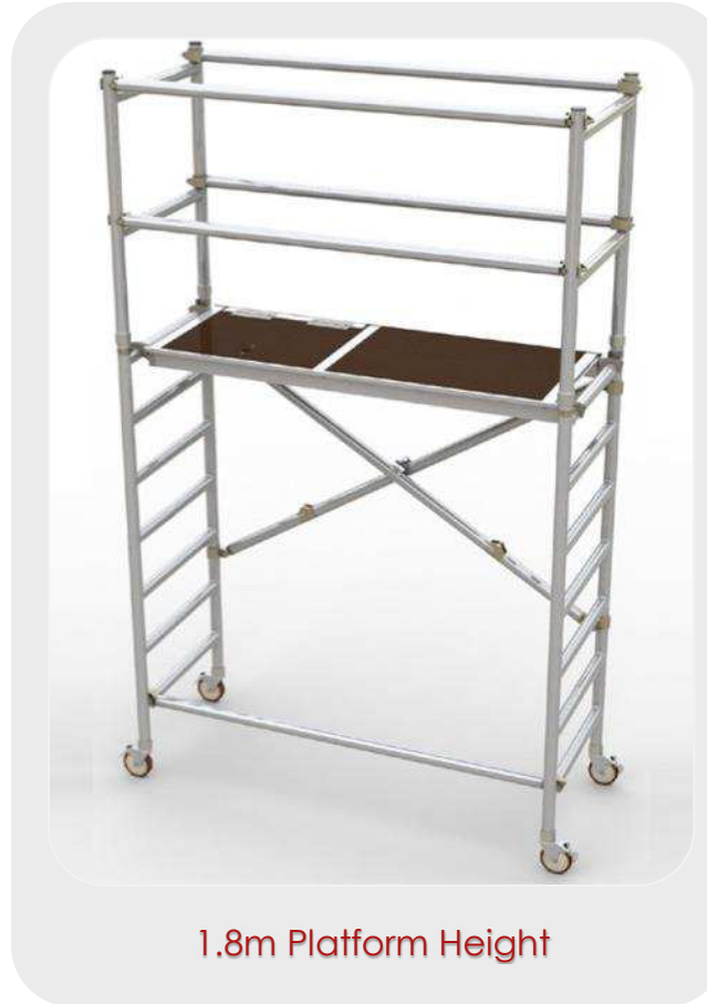
1.8m Platform Height

Compact: The Tradie Platform will fit through most doors, and is easy to assemble and dismantle.