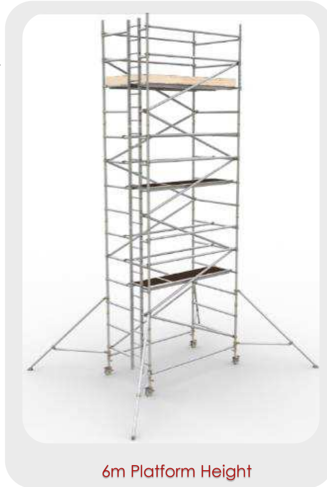
6m Platform Height

The Span 500 Trade is a high strength, lightweight aluminium tower delivering quality and durability at an affordable price. Available in single and double width wide with 500mm rung spacing, the Span 500 Trade is manufactured using quality aluminium tubing and fully TIG-welded frames for strength and safety.