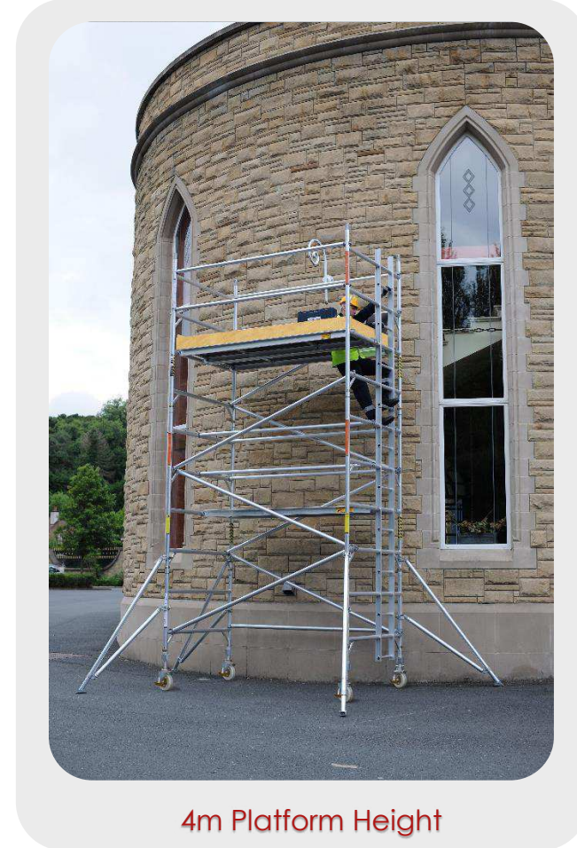
4m Platform Height