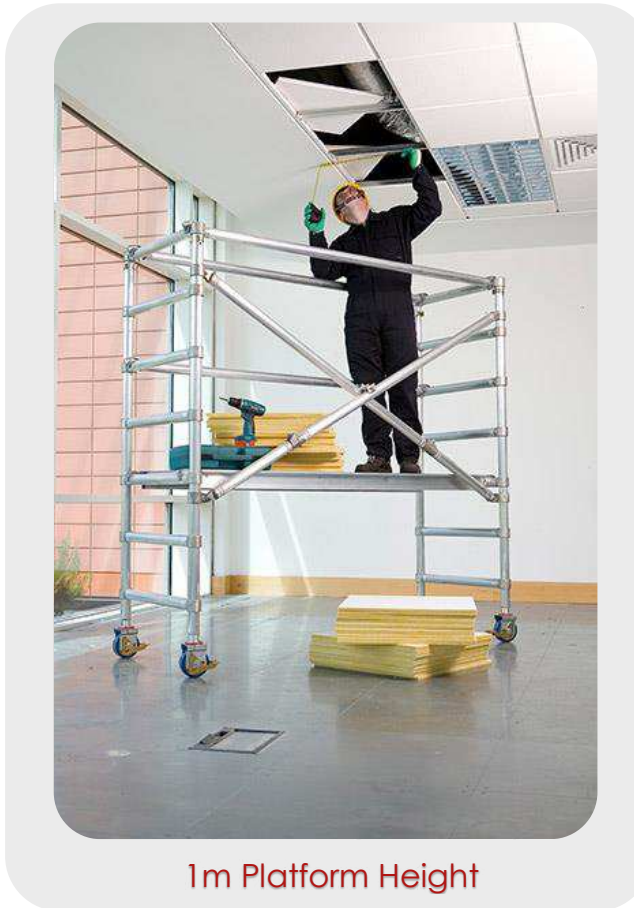
1m Platform Height