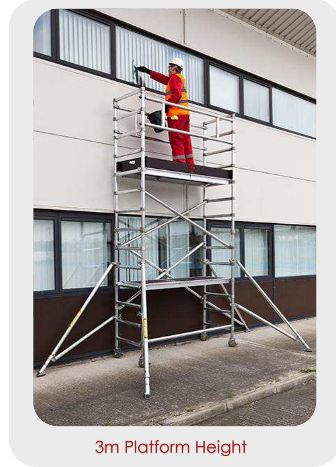
3m Platform Height