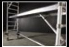
High Clearance Platform