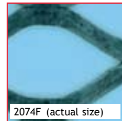
2074F (actual size)