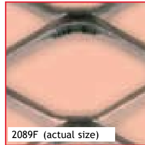
2089F (actual size)