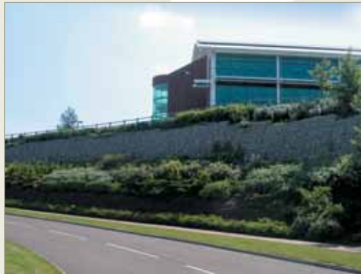
! Mass gravity Gabion retaining wall at Daresbury Business Park, England. Constructed 2000.

Walls of this type are normally built at an inclination of six degrees. Hesco Weldmesh® Concertainer® Gabion and Bastion walls can be constructed in stepped or flush-faced configurations depending on individual requirements. For further details please contact the Gabion Solutions Technical Department.