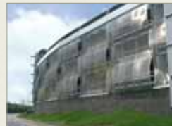
! Free standing Trapions™ clad a multi-storey car park. Clarence Dock, Leeds England. Constructed 2004.