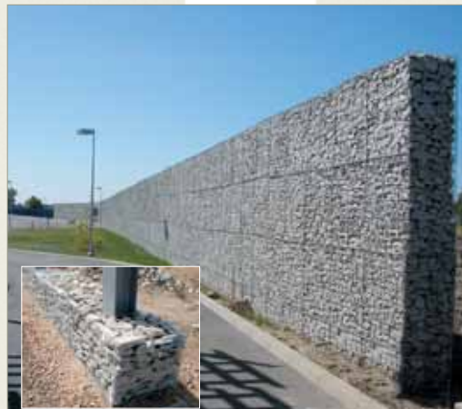
! A free standing, internally supported perimeter wall provides strength and durability for the new Gillette factory in Lodz, central Poland. Constructed 2005.