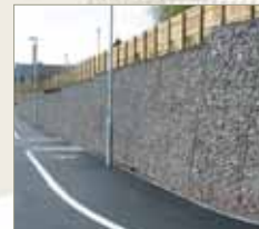
Gravity retaining wall at Europe's largest Tesco superstore, Coventry, England. Constructed 2004.