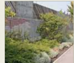
! Shopping Centre boundary with concrete colour inserts. England - constructed 1998.