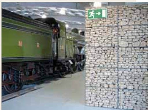
Locomotion Museum internal walkway - the limestone was filled by hand.