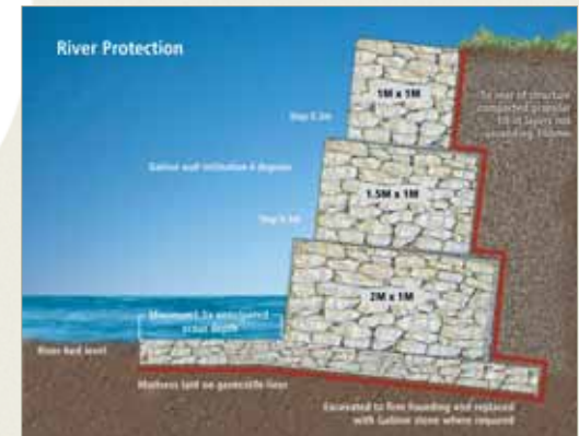
! Typical illustration section - not for construction.