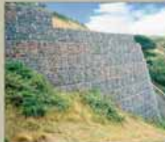
Jersey Airport, Channel Islands :: constructed 1968.