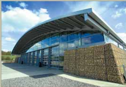
New National Railway Museum, England :: constructed 2004.