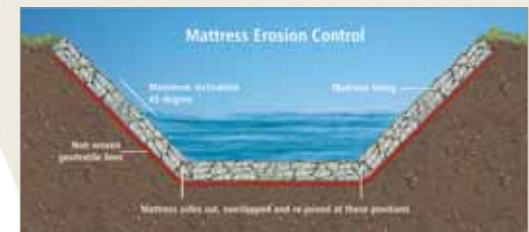
! Typical illustration section - not for construction.