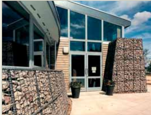
! Earth Centre, England. An environmentally friendly development which took full advantage of Trapion™ walls with a graded, crushed concrete fill. Constructed 2000.

Gabion product can also be used creatively to form monuments, pillars, signage plinths and seating.