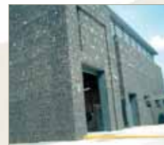
Architectural cladding to Duncree Scrubber Water Treatment Works, Belfast, N. Ireland. Constructed 2004.