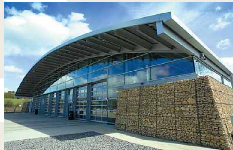
Locomotion Museum front entrance facade with Trapion™ walls and yellow limestone fill.

It was anticipated that the museum would bring 60,000 visitors a year to Shildon. However, during its first six months, it pulled in a staggering 94,000 visitors. It is home to more than 60 locomotives from the National Railway Collection including Timothy Hackworth's 'Sans Pareil'. This engine was used in the original trials to decide who operated the intercity passenger railway between Liverpool and Manchester. After 175 years of absence from the town, residents were delighted at her return. The Sans Pareil now sits proudly at the entrance of Locomotion - the first engine visitors will see.