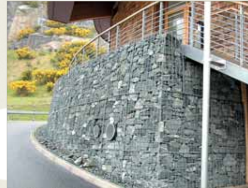
! The Eden Project - an imaginative architectural development that sought to integrate buildings more closely to nature. England. Constructed 2001.