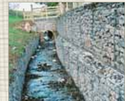
Channel lining constructed with Gabions and Mattresses, Graigfechan, Wales. Constructed 2000.