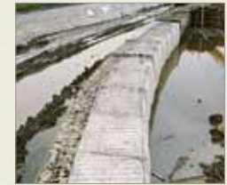
! Concrete filled Bastion flood wall construction, Collier Street, Scotland. Constructed 2001.