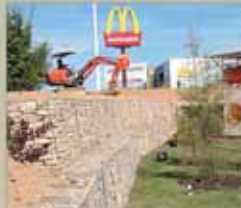
McDonalds, Chantier, France :: constructed 2004.