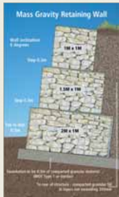
! Typical section illustration - not for construction.

Our Gabion and Mattress products are particularly useful as an integral part of hydraulic protection schemes - embankment stabilisation work on rivers, shore protection, reed beds, canals and channel linings.