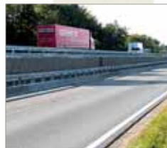
! Highway application, A1 Kettering, England.