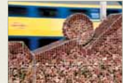
! Den Haag, Holland - detail of railway inspired free standing wall. Constructed 2005.