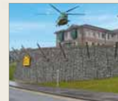
Gravity retaining wall supporting a helipad at Turro Hospital, England. Constructed 2004.