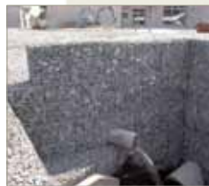
! Gabion as an integral part of a drainage structure. Constructed N.Ireland 2002