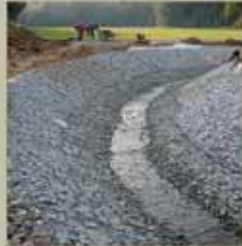
Culvert Lining, A4 Krzywa, Poland :: constructed 2005.