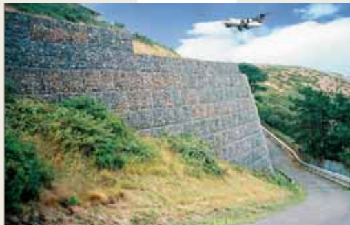
Mass gravity Gabion wall - 19m high and constructed in 1968 to support Jersey airport in the Channel Islands.

This programme has been carried out in conjunction with Hesco Bastion Limited, who have been responsible for developing and patenting the unique Hesco Concertainer®