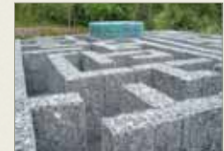
! Glass blocks and local stone fill an unusual maze development in Kielder Forest, England.