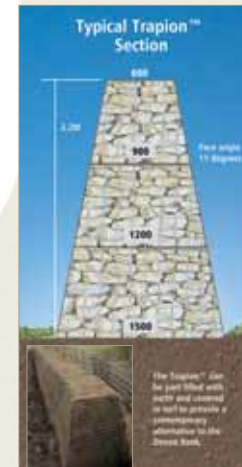
! Typical section illustration - not for construction.

Devon Bank Alternative Devon banks were originally formed from an outer layer of turf with a soil infill producing a natural roadside barrier. By employing the Hesco Weldmesh® Concertainer® Trapion™ as a base unit, a similar construction can be made without the high degree of skill and labour required with the traditional approach and construction method.