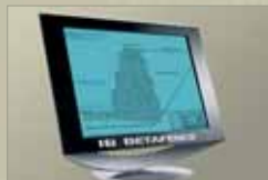
Betafence employ the latest technology to support your project.

Betafence can provide on request, on site training to contractors.