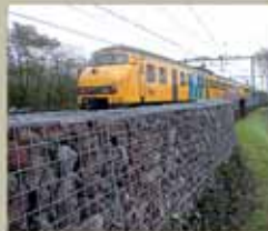
Sound Barrier, Den Haag, Holland :: constructed 2005.