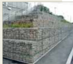
! Retaining wall, Score Project, London, England. Constructed 2004