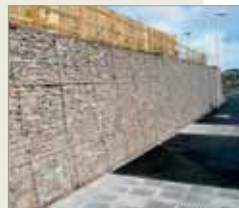
! Retail park application - retaining boundary wall.