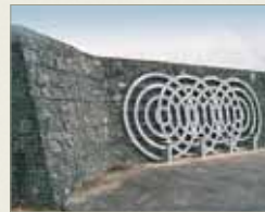
! Trapions™ form a sound barrier at the ECOS Centre, Northern Ireland. Constructed 1999.