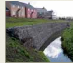
! Mass gravity retaining wall with Mattress erosion protection, Bristol, England. Constructed 2004.

The use of semi-rigid Hesco Concertainer® Gabions in both standard and non-standard sizes, is a fast, environmentally sound and cost-effective method of establishing the necessary inlet and outlet perimeter walls.