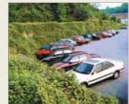
! Retaining wall planted with vines and creepers. England - constructed 1986.