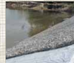
Shore protection using Weldmesh® Mattresses, Czeszow, Poland. Constructed 2005.