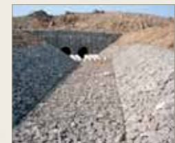
Culvert lining using Mattresses to the A465 heads of the Valley Road, South Wales. Constructed 2004.